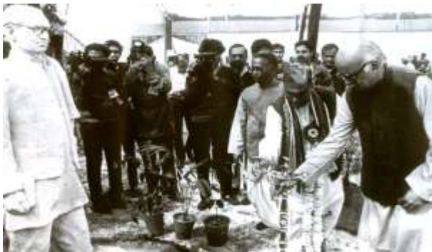
Advani ji and Joshi ji light the lamp in front of Pt. Deendayal Upadhyaya's Statue at the Jaipur convention