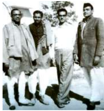
Pandit ji with Atal ji