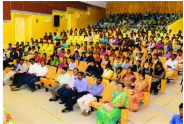
Students from various Departments of our Alagappa University