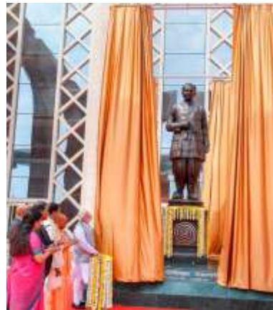
Prime Minister Shri. Narendra Modi unveils the statue of Pandit Deendayal Upadhyaya, during the inauguration of the Pt. Deendayal Upadhyaya Institute of Archaeology, at Greater Noida.