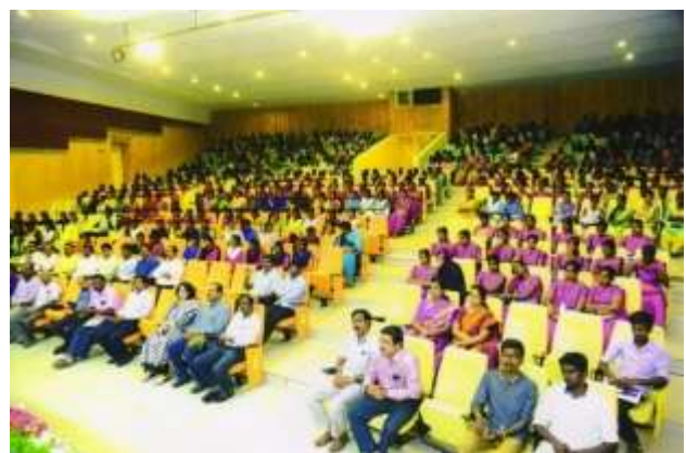
Students from various Departments of Alagappa University and affiliated colleges