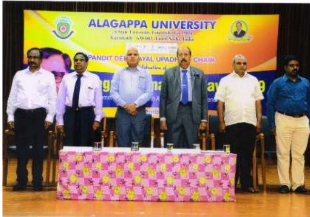
Inauguration of Integral Humanism Day - 2019