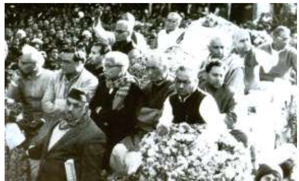
Bidding a tearful farewell to Pt. Deendayal Upadhyaya