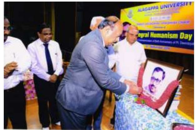
The dignitaries paid their homage to Pandit Deendayal Upadhyay