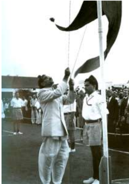
Pt. Deendayal Upadhyaya, hoisting the flag in RSS programme