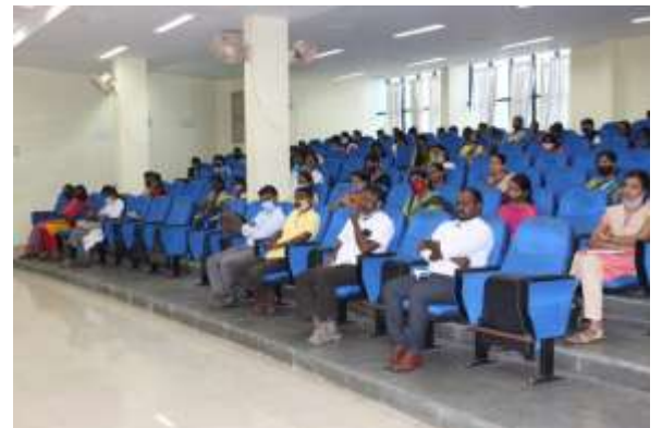
Teaching Assistants, Students from various Departments of our Alagappa University