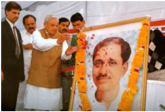
Shri Atal Bihari Vajpayee paying floral tribute on the photo of Pt. Deendayal Upadhyaya on the occasion of 'Samarpan Diwas'