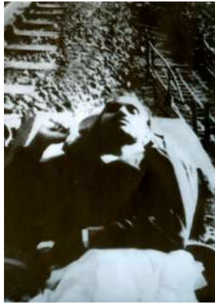
The dead body of Pt. Deendayal Upadhyaya lying beside the railway lines near Mughalsarai on 11 February, 1968