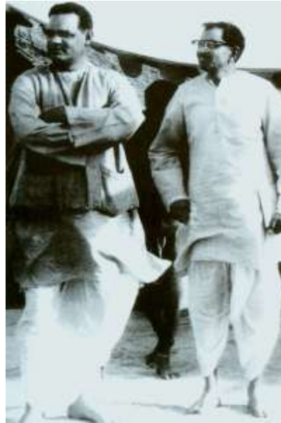
The new President Pt. Deendayal Upadhyaya and Atal ji together appear as glorious as the duo, Vivekanand and Paramhansa (1967)