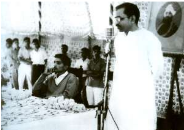
Pt. Deendayal Upadhyaya speaking on the occasion of the inauguration of the B.R. College Student's Union, Agra