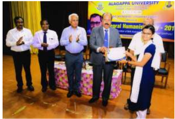
The Vice – Chancellor were distributed the certificates to the winners of the competitions in the Integral Humanism Day – 2019 celebrations on 25th September 2019.