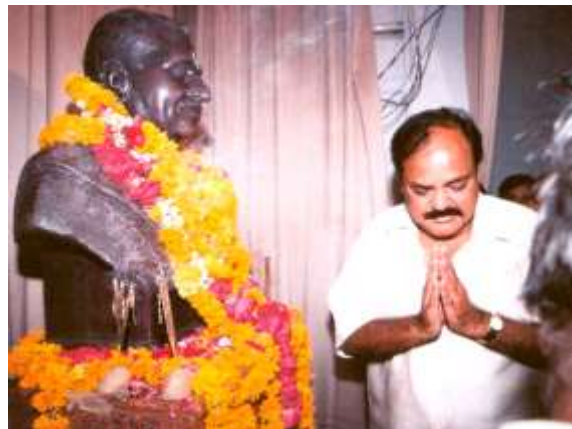
Shri Venkaiah Naidu paying homage to Pt. Deendayal Upadhyaya by garlanding his statue