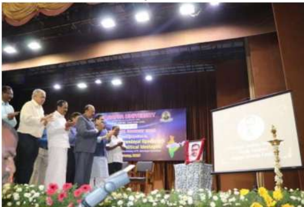
The dignitaries paid their homage to Pandit Deendayal Upadhyay