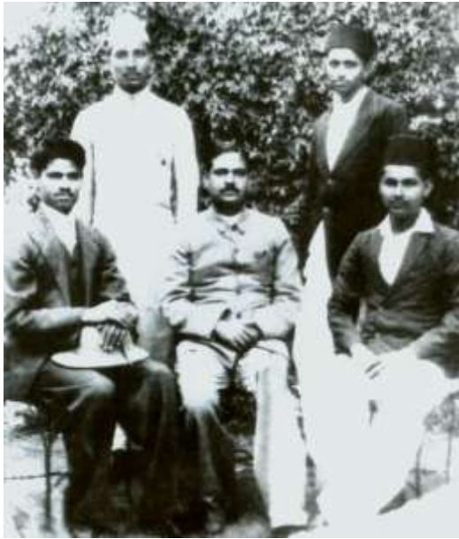
Pt. Deendayal Upadhyaya with his teachers