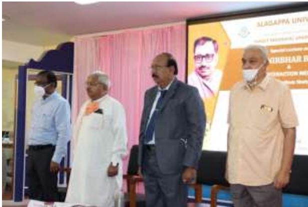
Inauguration of Special Lecture on Atmanirbhar Bharat on 25.01.2021