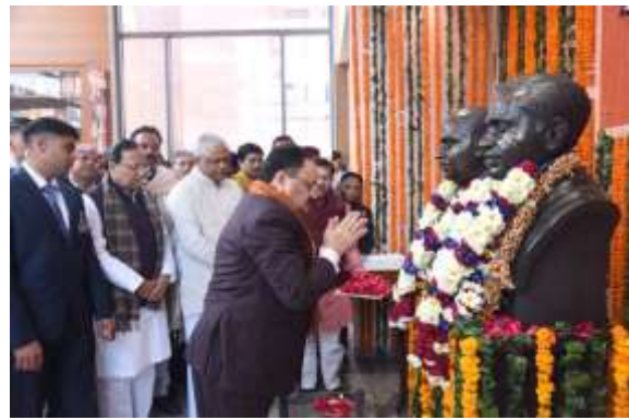
Shri J.P.Nadda Tribute to Pt. Deendayal Upadhyay