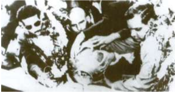
Shri Atal Bihari Vajpayee and other leaders immersing the ashes of Pt. Deendayal Upadhyaya at the Sangam in Prayag, February 1968