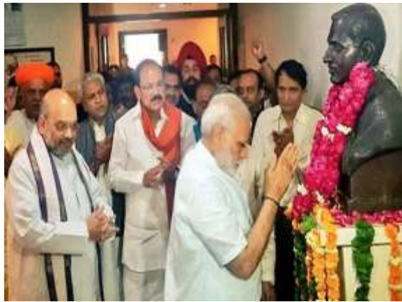
Shri. Venkaiah Naidu, Shri. Narendra Modi, Shri. Amit Shaw pay tributes to Upadhyaya