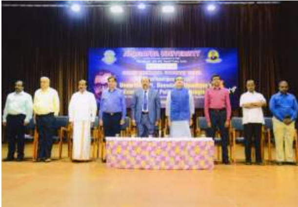
Inauguration of National Level Symposium on Pt. Deendayal Upadhyay: Social & Social & Economic Thoughts on 11.02.2020