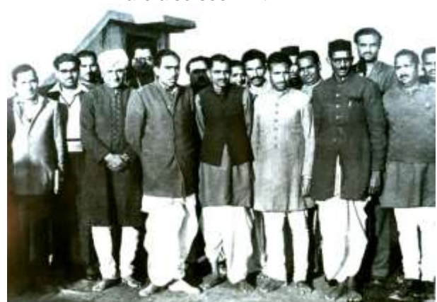
Pt. Deendayal Upadhyaya with leaders of the Jana Sangh.