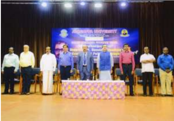
Inauguration of National Level Symposium on Pt. Deendayal Upadhyay: Social & Social & Economic Thoughts on 11.02.2020