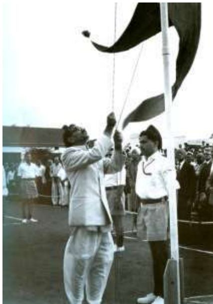
Pt. Deendayal Upadhyaya, hoisting the flag in RSS programme