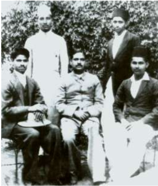
Pt. Deendayal Upadhyaya with his teachers