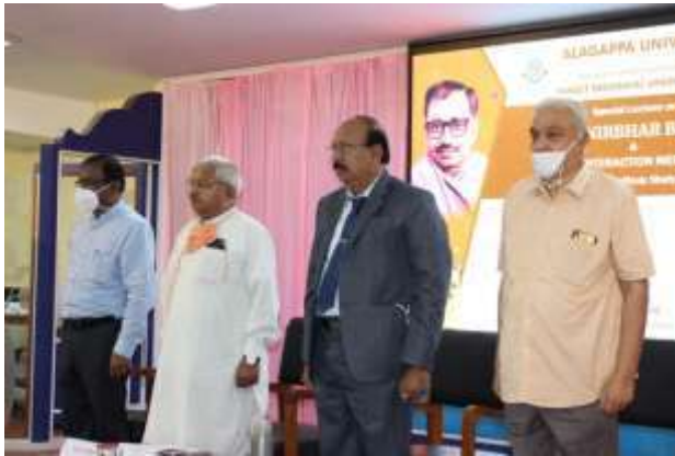
Inauguration of Special Lecture on Atmanirbhar Bharat on 25.01.2021