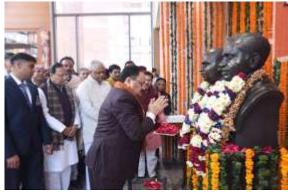
Shri J.P.Nadda Tribute to Pt. Deendayal Upadhyay