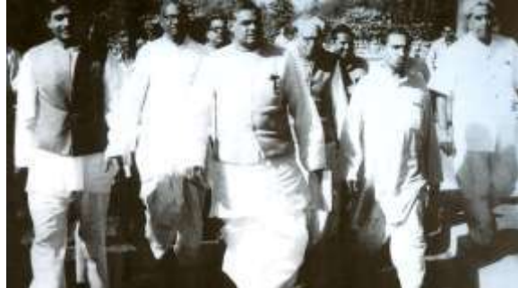
The lamp of life is put out- Shri Atal ji, Balraj Madhok, Sunder Singh Bhandari, Dr Bhai Mahavir and other leaders demanding a judicial enquiry into Pt. Deendayal's death