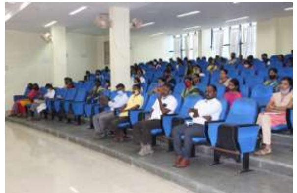
Teaching Assistants, Students from various Departments of our Alagappa University