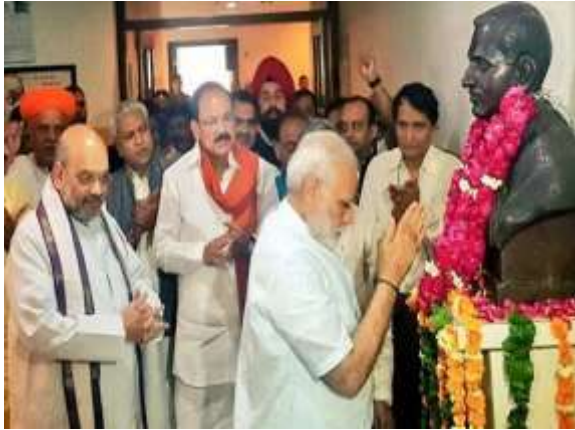
Shri. Venkaiah Naidu, Shri. Narendra Modi, Shri. Amit Shaw pay tributes to Upadhyaya