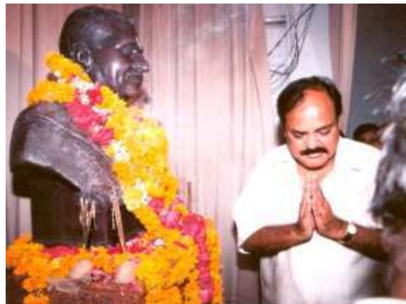
Shri Venkaiah Naidu paying homage to Pt. Deendayal Upadhyaya by garlanding his statue