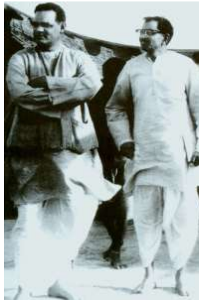
The new President Pt. Deendayal Upadhyaya and Atal ji together appear as glorious as the duo, Vivekanand and Paramhansa (1967)