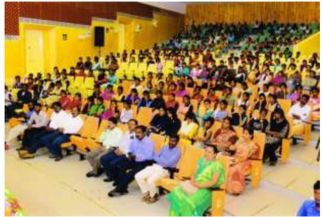
Students from various Departments of our Alagappa University