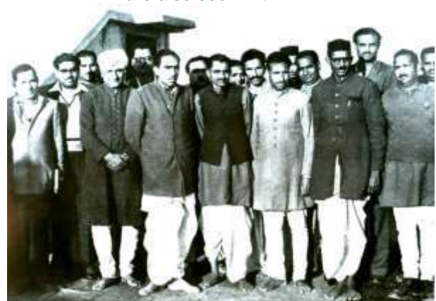
Pt. Deendayal Upadhyaya with leaders of the Jana Sangh.