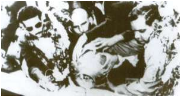
Shri Atal Bihari Vajpayee and other leaders immersing the ashes of Pt. Deendayal Upadhyaya at the Sangam in Prayag, February 1968