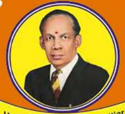
Vallal Dr. RM. Alagappa Chettiar