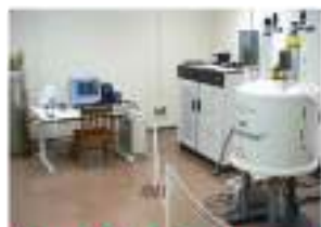
Proton NMR Spectrometer

To enhance research facilities, procurement of Proton Nuclear Magnetic Resonance (NMR) spectrometer at a cost of Rs.450 lakhs , Powder X-ray Diffractometer (XRD) at a cost of Rs.125 lakhs , SCUBA diving equipment are prioritized in first installment. Accordingly, the Open tender has been issued and the Technical and Commercial bids are completed. The work orders will be released shortly.