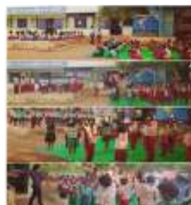
Yoga Training at Schools

100% ODF Achievement in Adopted Village 'Ariyakudi'