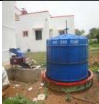
Bio-Gas plant installed in the University Hostels