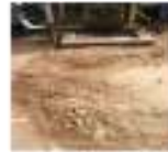
After our Service