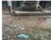
Before our Service