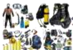
SCUBA Diving Equipment