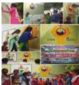
Awareness Paintings in the Walls

39 Villages Adopted (One Department and One Village)