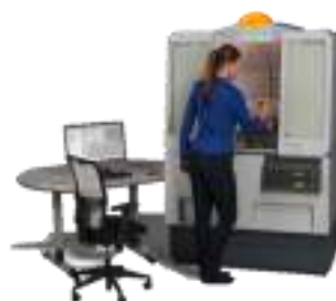
Multipurpose Powder XRD