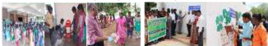
Segregation of Solid Waste