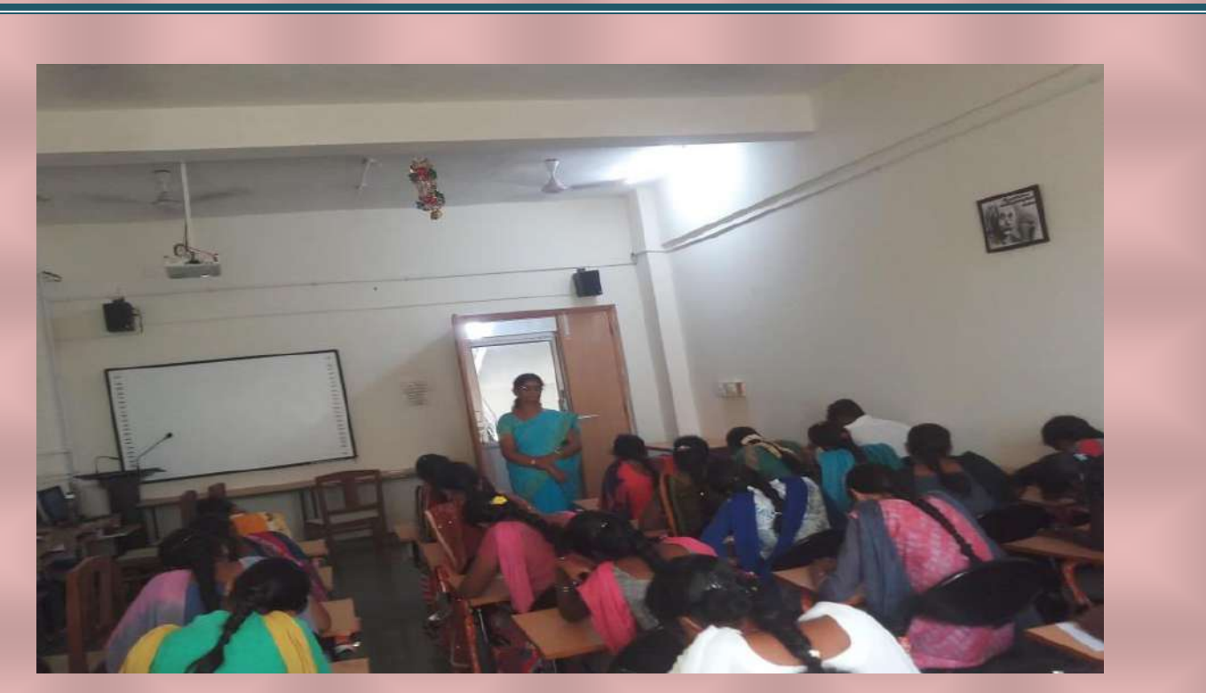
Students' receiving prices from our Honorable Vice chancellor