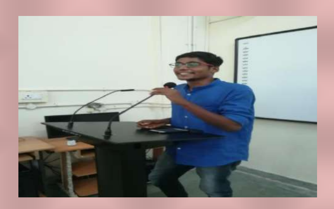
Vote of Thanks