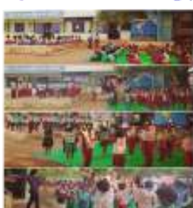
Yoga Training at Schools